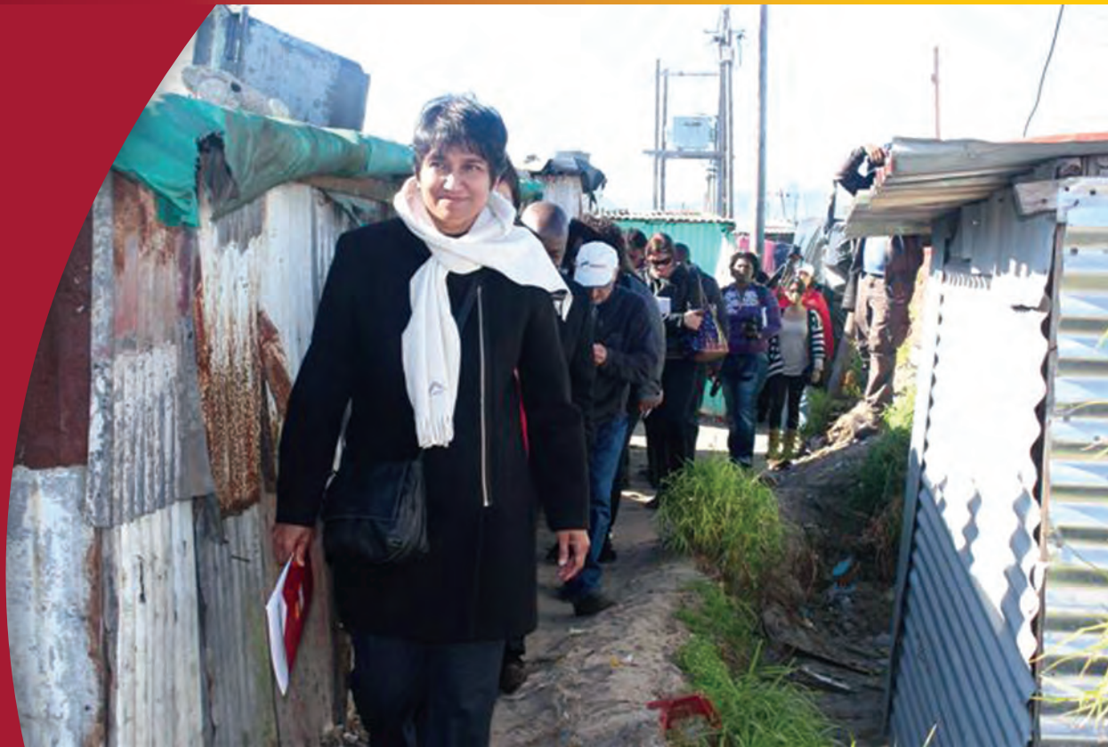
Deputy Chair of the Provincial Government being guided by Khayelitsha Community members during a site inspection.

Water is Life. Sanitation is Dignity: Accountability to People who are Poor