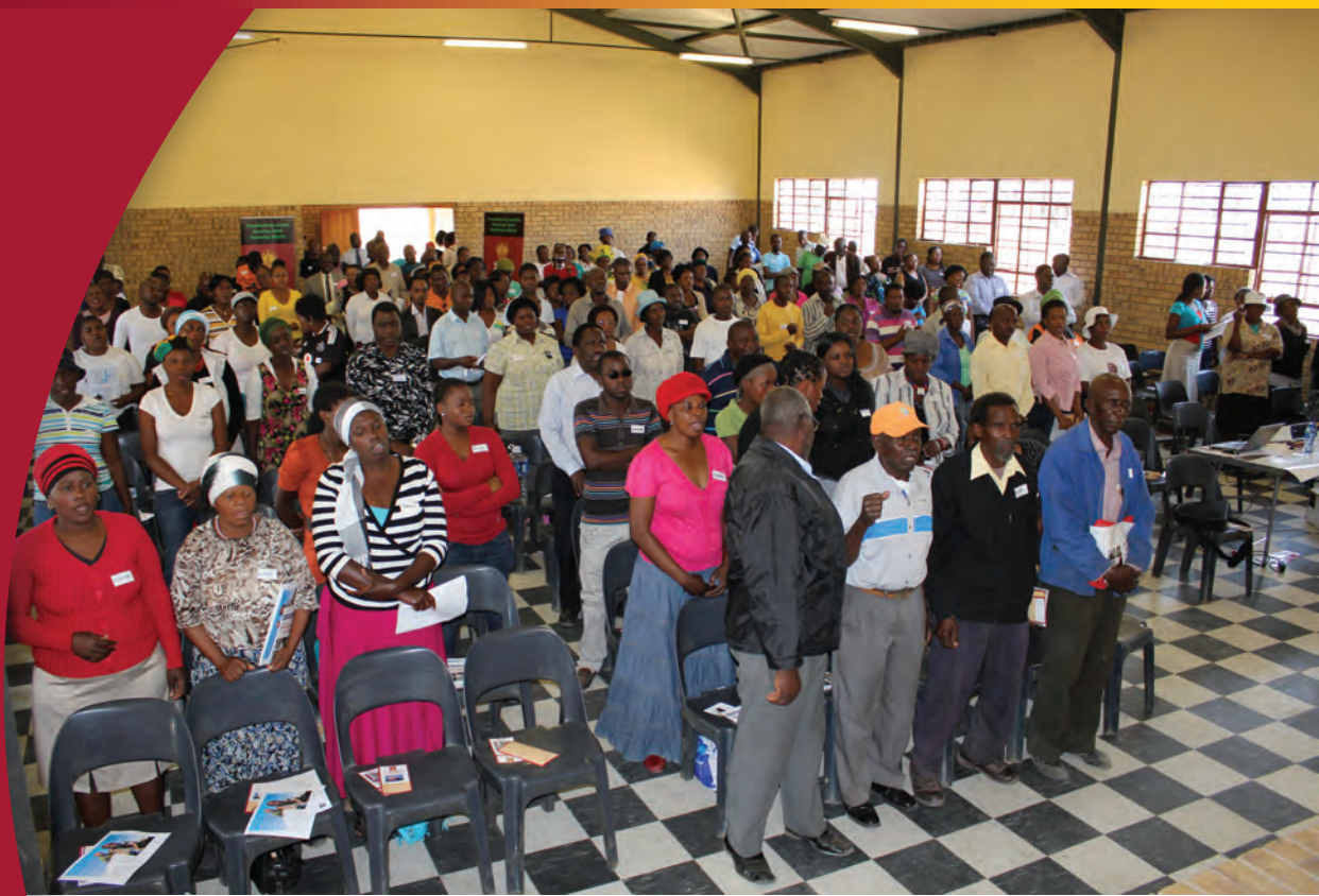
Community members at the Commission's Mpumalanga Province hearing, who came to share their experience of the lack of water and sanitation.

Water is Life. Sanitation is Dignity: Accountability to People who are Poor