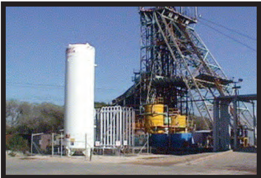
Figure 5: An example of an AMD water treatment plant – active treatment technology

The most widespread method used to mitigate acidic effluents is an active treatment process involving addition of a chemical-neutralising agent. 3 Addition of an alkaline material, such as lime, to AMD will raise its pH, accelerate the rate of chemical oxidation of ferrous iron, and cause many of the metals present in solution to precipitate as hydroxides and carbonates. The use of lime to neutralise AMD and precipitate metals is considered, within this booklet, as the standard against which other methods are compared as it has been the automatic treatment choice for many years. 4