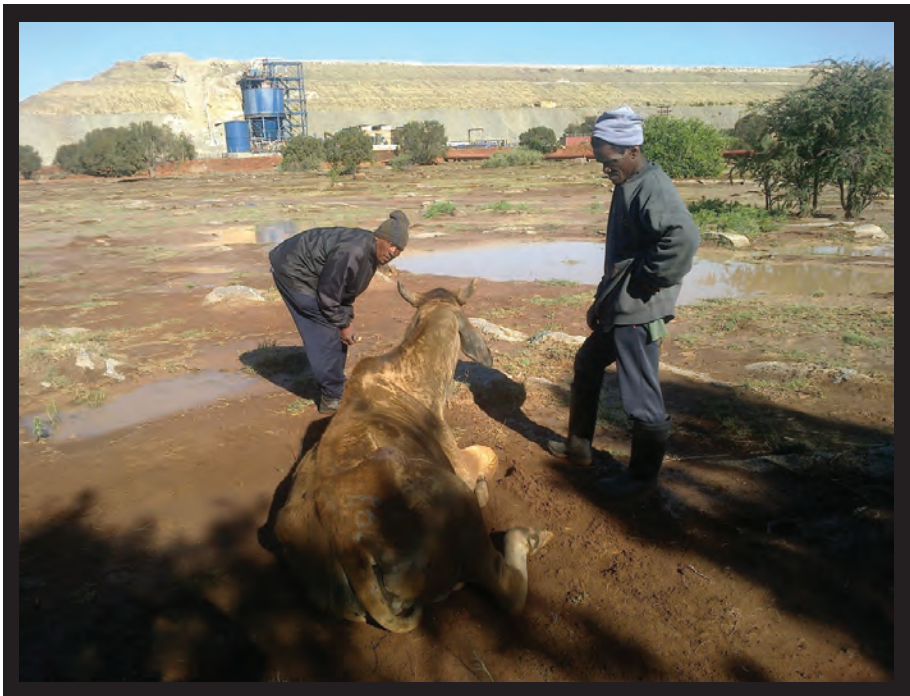
Figure 4: AMD has serious adverse health consequences for humans and animals

Therefore, mines ought to make efforts to engage in broader multi-stakeholder engagement, particularly with civil society organisations which they may misguidedly