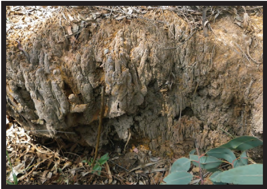
Figure 8: An image of AMD crust formation on natural vegetation

Within its legislative mandate, the Commission has the power to establish expert-advisory committees that have a particular focal point. The first subsection of Section 5 of the Human Rights Commission Act No. 54 of 1994 stipulates that the Commission may establish one or more committees consisting of one or more members of the Commission, and one or more other persons, if any, whom the Commission may appoint for that purpose and for the period determined by it. With the Commission's focus on the right to a safe and clean environment and the designation of a dedicated Commissioner to deal specifically with natural resource management and human rights, the Commission is well-placed to carry out a number of activities in promoting and protecting the right to an environment that is not harmful to health or well-being. The purpose of such a Committee is to advise the Commission as a NHRI, established in terms of the Paris Principles, on possible roles and activities that could be undertaken in terms of its constitutional mandate to promote and monitor access to the above right.