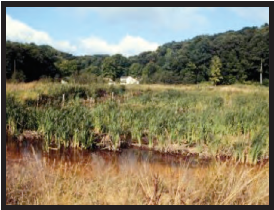
Figure 6: An example of a wetland for passive AMD treatment

Passive treatment systems by comparison are designed to allow for low, or no, maintenance and should be self-contained with regards to treatment and waste. This category of treatment is generally restricted to the use of wetlands to remediate the AMD. There are many instances of mine water running into naturally occurring wetlands where the water emanating from the wetland is improved with regard to both metal content and acidity. The attraction of the wetland is that the bacteria that occur naturally in the sediments are capable of reducing the sulphate in the acid to hydrogen sulphide which can react with the metals to form the metal sulphide minerals which originally caused the AMD.