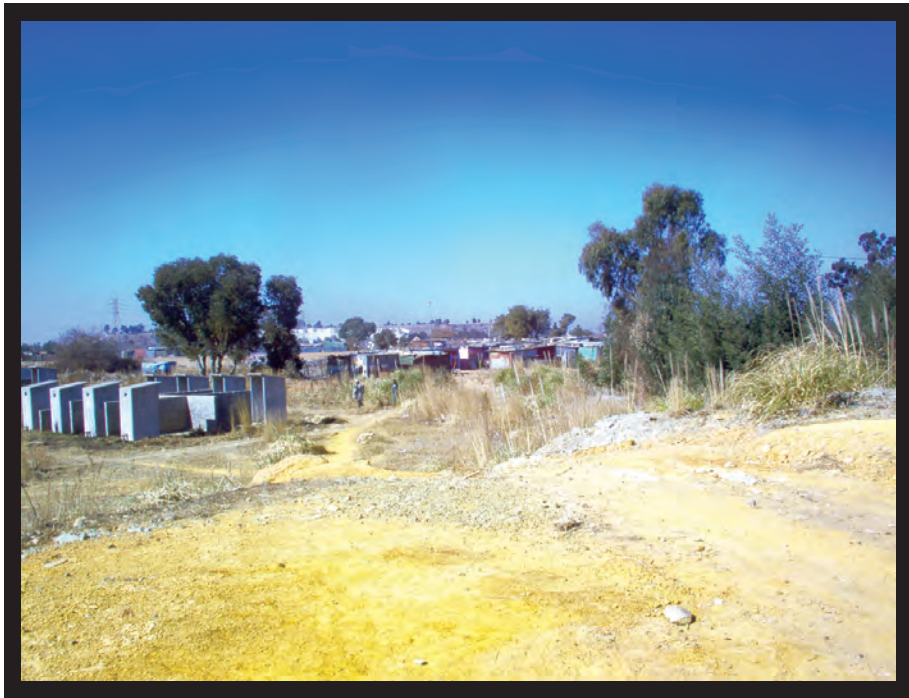
Figure 3: Informal settlement located on tailings dump