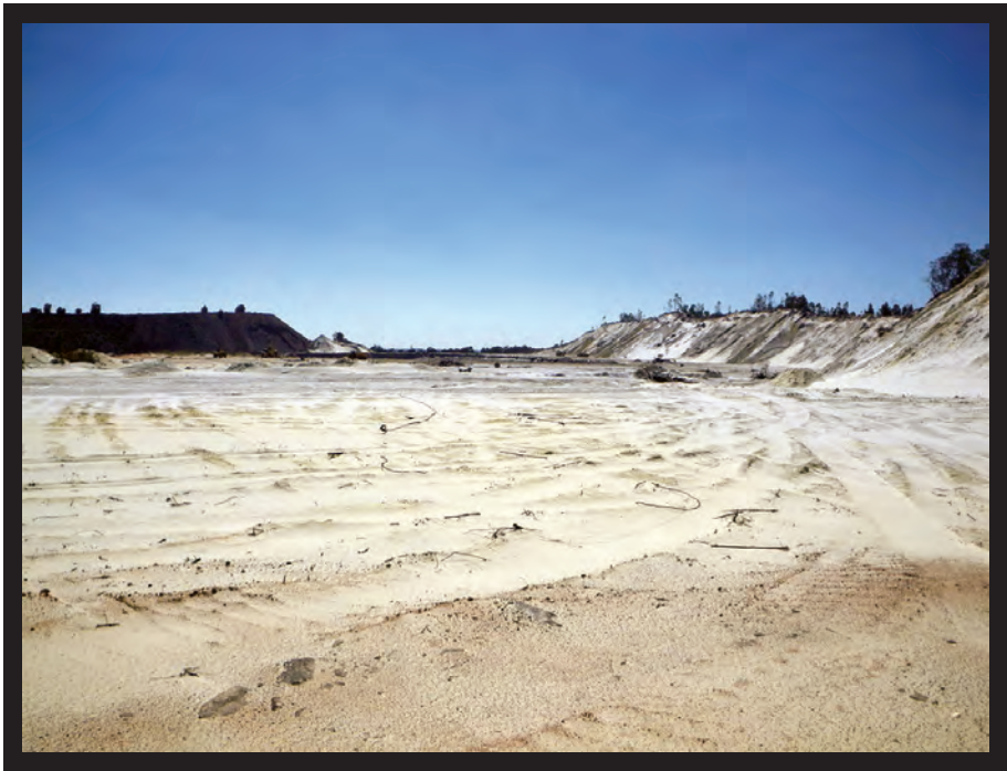
Figure 2: The uraniferous Randfontein Robinson dump in 2012