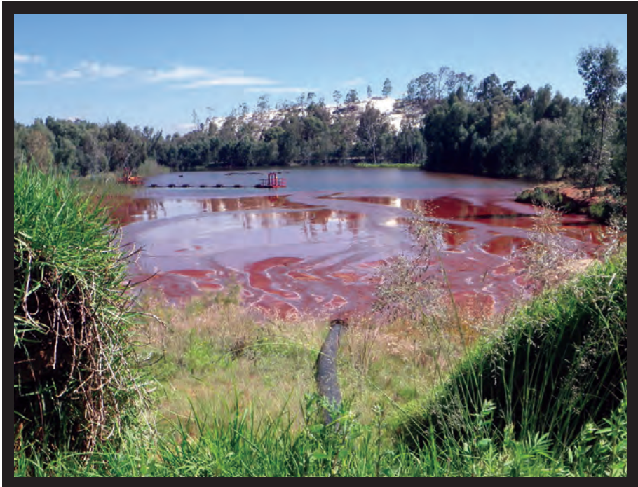
Figure 7: An image of the formed AMD dam at the Robinson dump, West Rand, Gauteng

June 2012. In the Eastern Basin, where pumping stopped in January 2011, it is estimated that the ECL will be breached in June 2013.